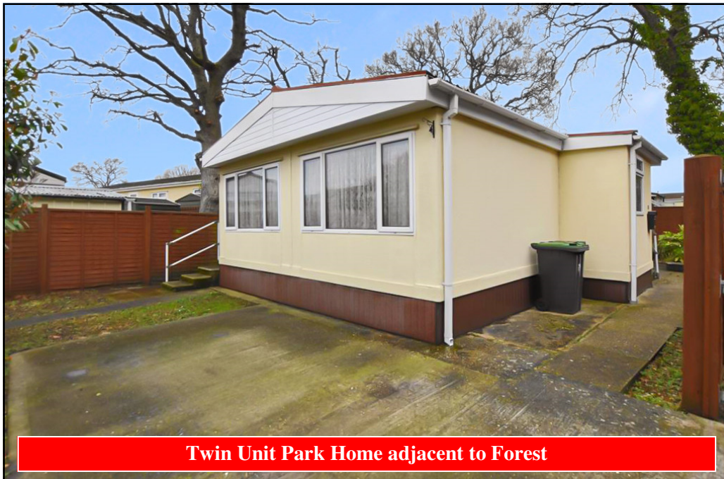
Twin Unit Park Home adjacent to Forest

83 The Copse, Oaktree Park, St Leonards, Ringwood, Hampshire. BH24 2RH